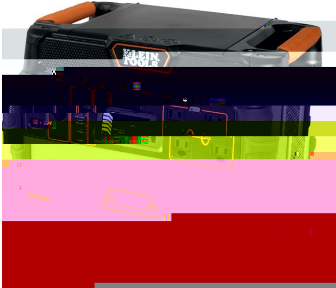
Recalled Klein Tools KTB1000 Portable Rechargeable Power Station